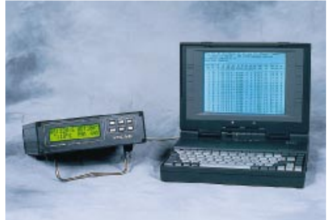
▲ The 26700 Translator functions equally well as a stand-alone display or as the heart of a sophisticated monitoring system.